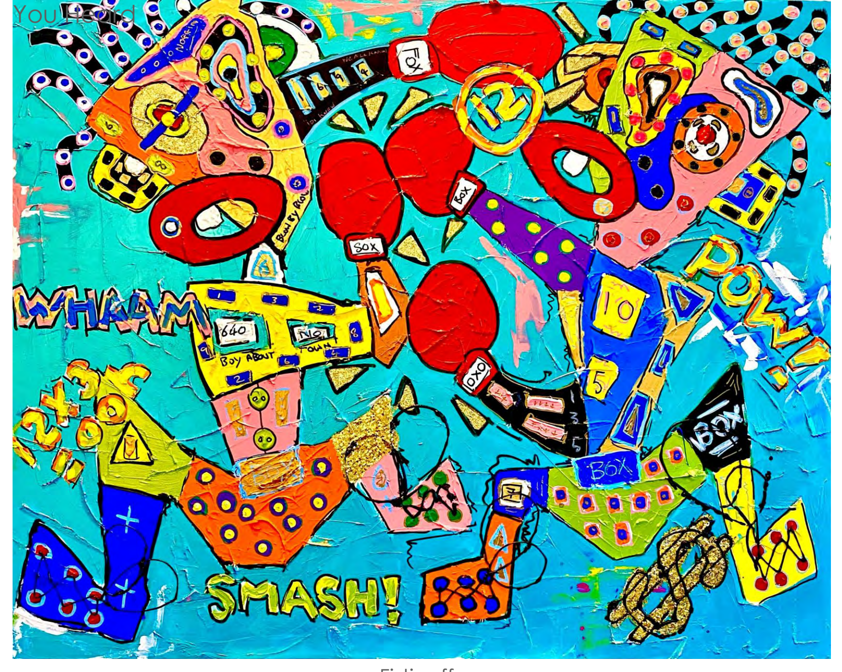
Fisticuffs Acrylic and glitter on canvas, 100 x 120 cm, 2022; £2,400